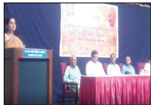
Dignitaries at the Gandhi memorial lecture.