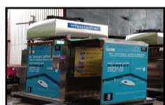
E-toilet setup near to Sambhaji Garden JM road

Yet, while saying further she, 'Said carrying coin every time is difficult'. Human sensor e-toilet project based on Kerala model was setup by a (Kerala manufacturing company 'Eram scientific'). Which is also the part