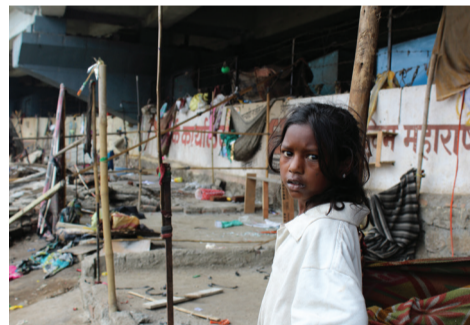
A little girl watches her destroyed home.