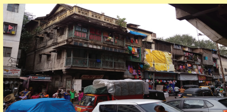
Decade Old fragile building in budhwar peth