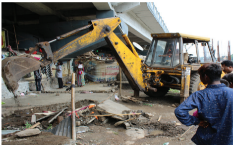
A backhoe been used to demolish the huts.